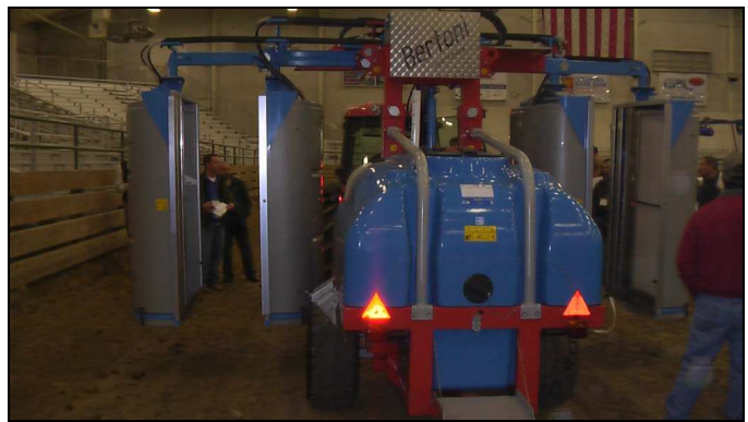
Two sprayers designed to target application in the canopy. The Bertoni (lower picture) also recaptures and reuses material that would have fallen to the vineyard floor.